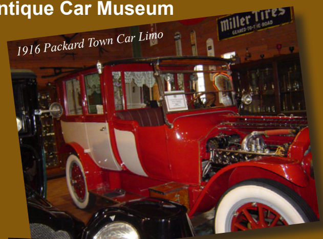
1916 Packard Town Car Limo