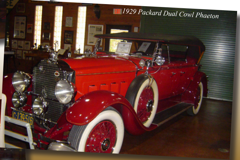
1929 Packard Dual Cowl Phaeton