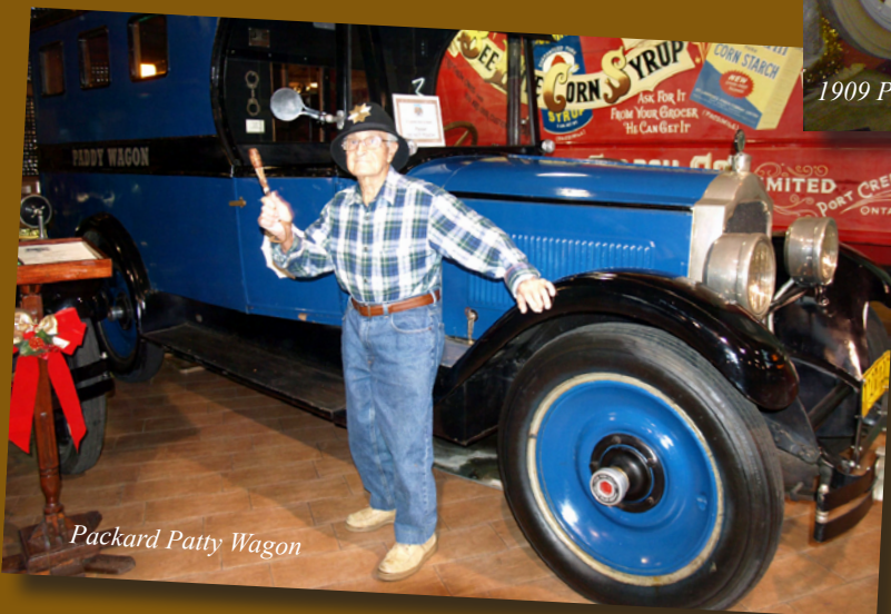
Packard Patty Wagon