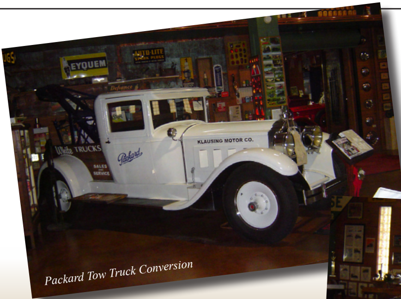
Packard Tow Truck Conversion