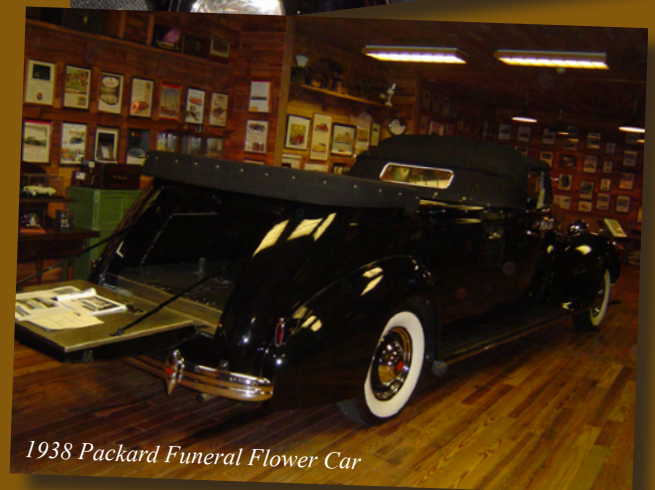
1938 Packard Funeral Flower Car