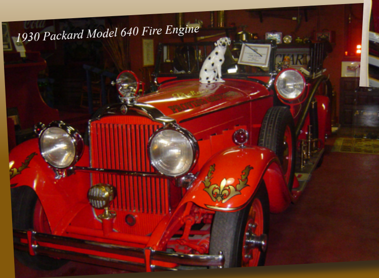
1930 Packard Model 640 Fire Engine